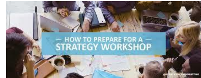
Linking Strategy to Projects

3.- Practitioners – the people who do the work of strategy